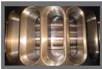
Superior piston cleanliness