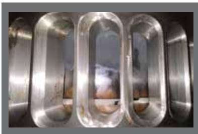
Piston crown: minimal carbon deposit